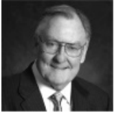
James R. Thompson Principal Occupation: Senior Chairman and Partner of the Law Firm of Winston & Strawn LLP Age: 70 Director Since: 2001

Governor Thompson served as the Chairman of the Chicago law firm of Winston & Strawn LLP from January 1993 to September 2006. He joined the firm in January 1991 after serving four terms as Governor of the State of Illinois. Prior to his terms as Governor, he served as U.S. Attorney for the Northern District of Illinois from 1971-1975. Governor Thompson served as the Chief of the Department of Law Enforcement and Public Protection in the Office of the Attorney General of Illinois, as an Associate Professor at Northwestern University School of Law and as an Assistant State's Attorney of Cook County. Governor Thompson was a member of the National Commission on Terrorist Attacks Upon the United States (also known as the 9/11 Commission). He is the Chairman of the United HEREIU Public Review Board and serves on the Boards of Directors of FMC Corporation, Navigant Consulting Group, Inc. and Maximus, Inc.